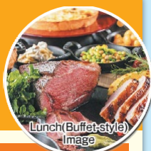
Lunch (Buffet-style) image