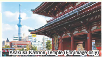
Asakusa Kannon Temple (For image only)

*Hybrid bus is subject to change to normal bus