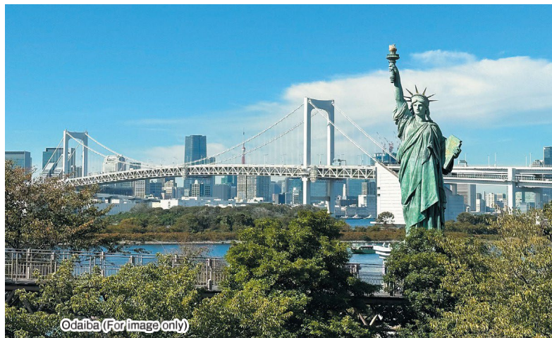
Odaiba (For image only)