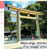
Meiji-jingu shrine (For image only)