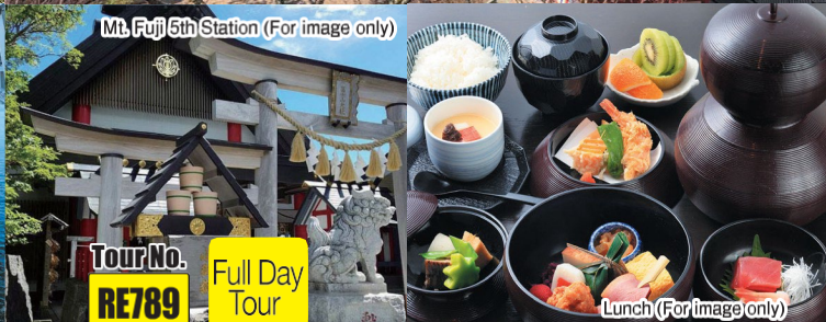
Mt. Fuji 5th Station (For image only)