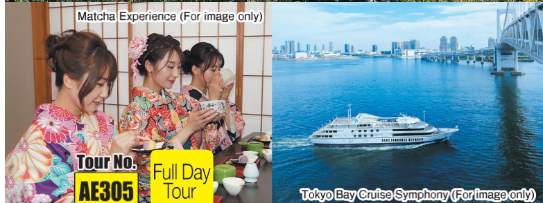
Matcha Experience (For image only)