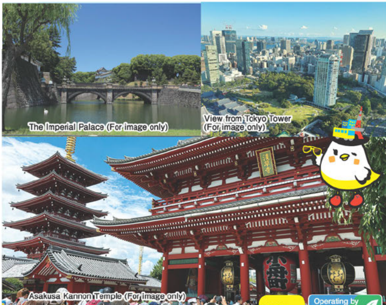
The Imperial Palace (For image only)