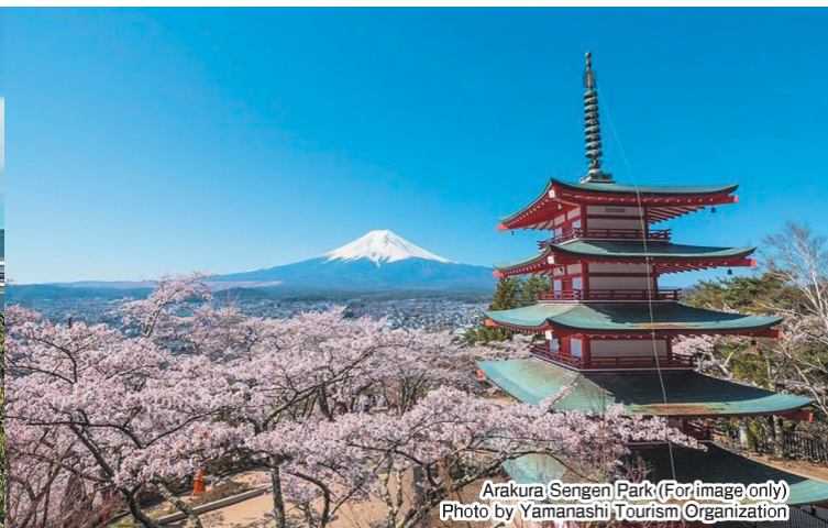
Arakura Sengen Park (For image only)