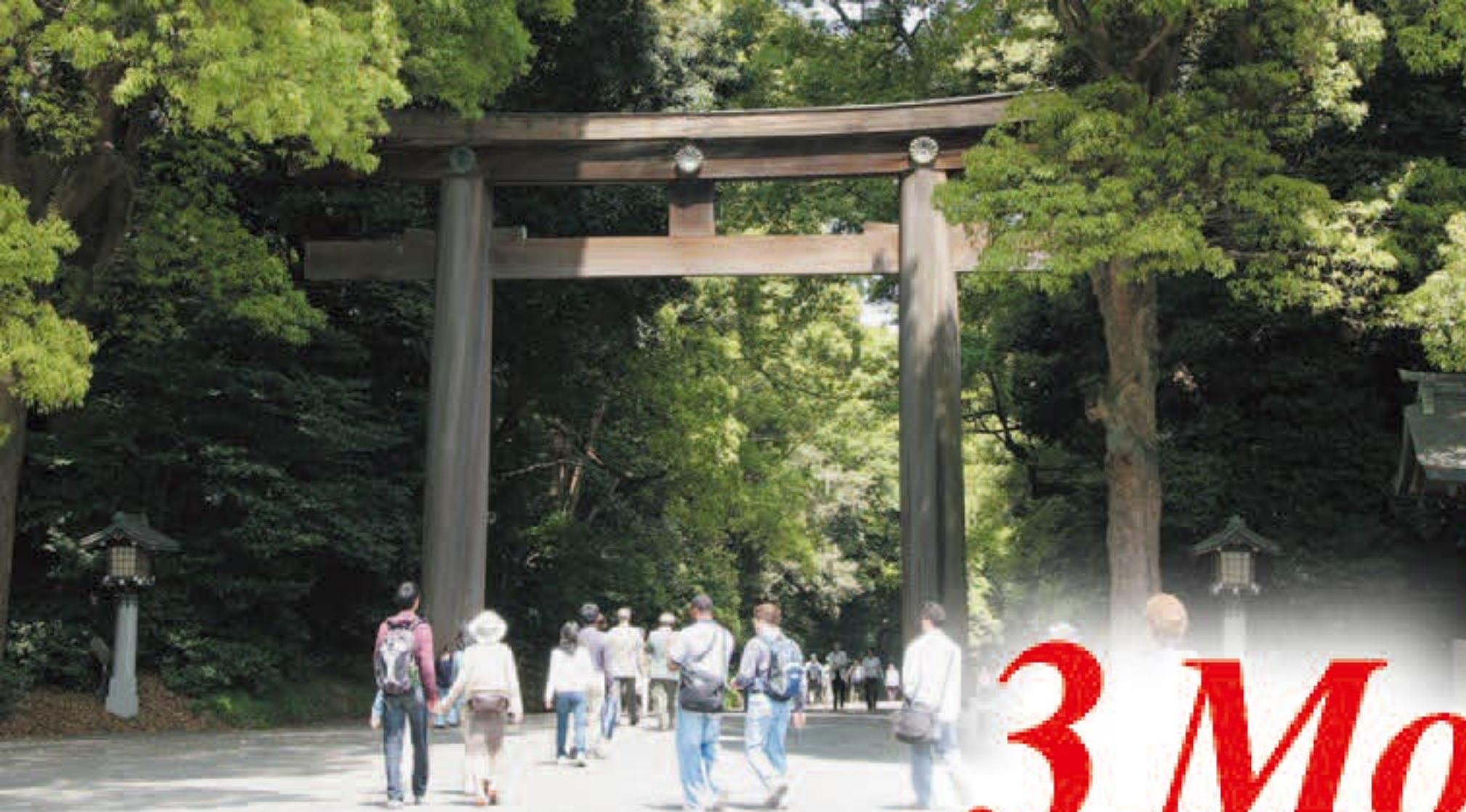
Meiji-jingu shrine (For image only)