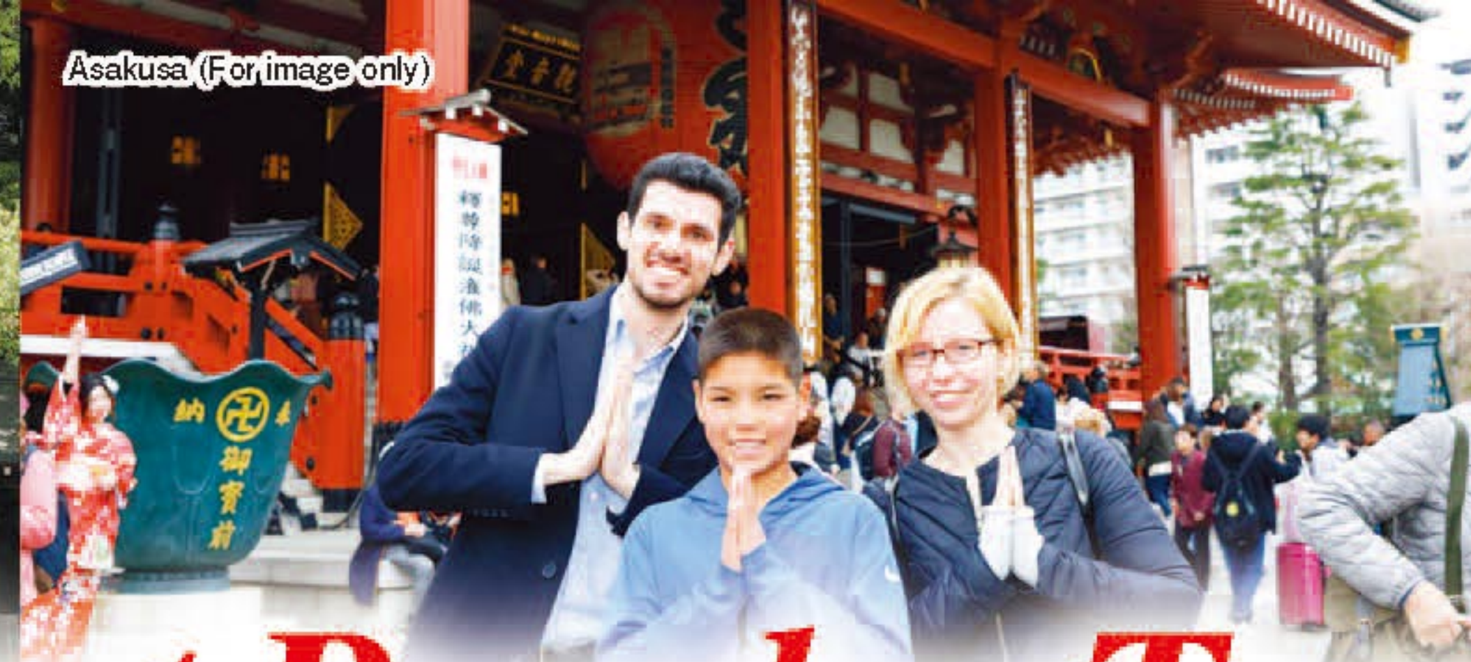
Asakusa (For image only)