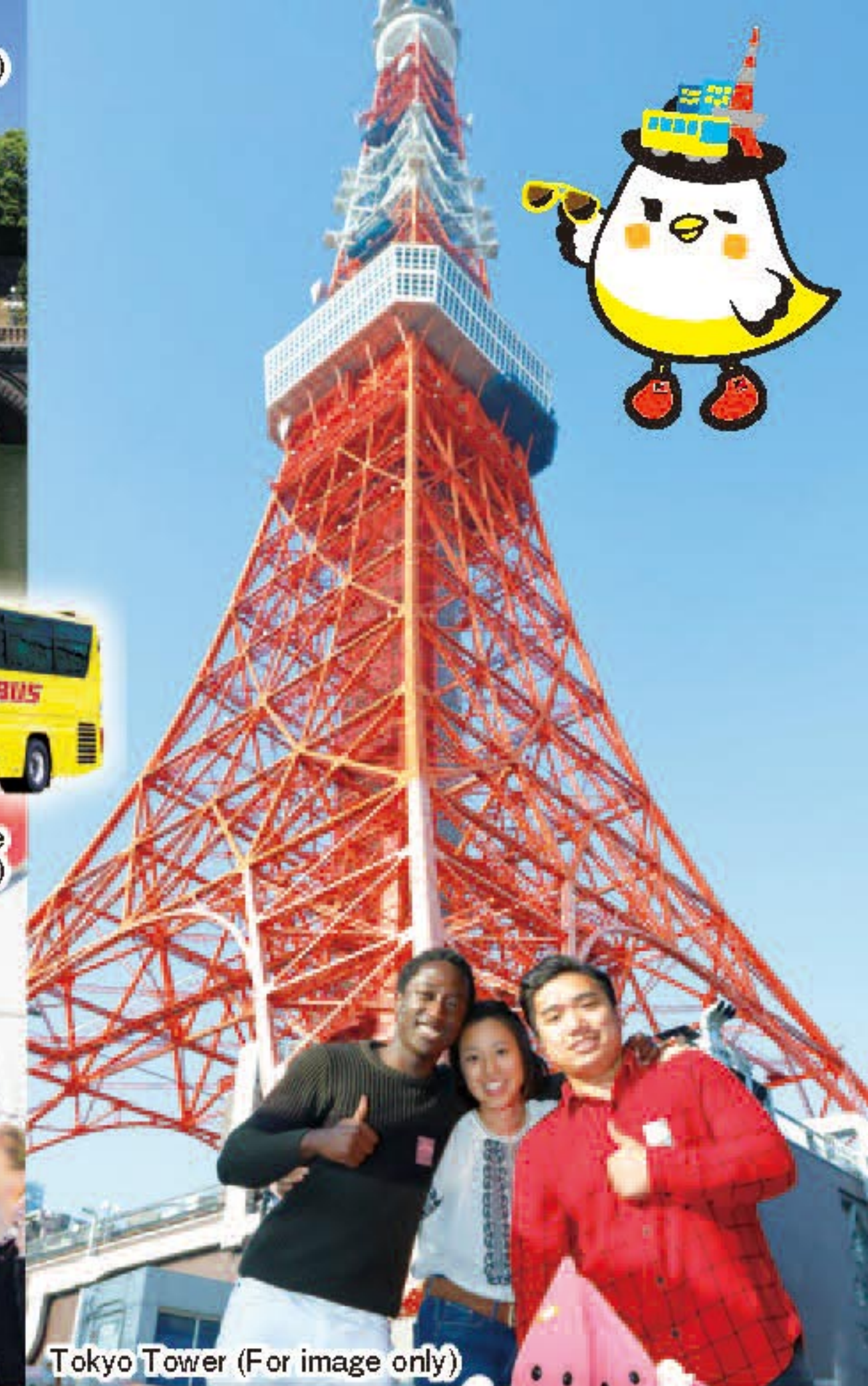
Tokyo Tower (For image only)