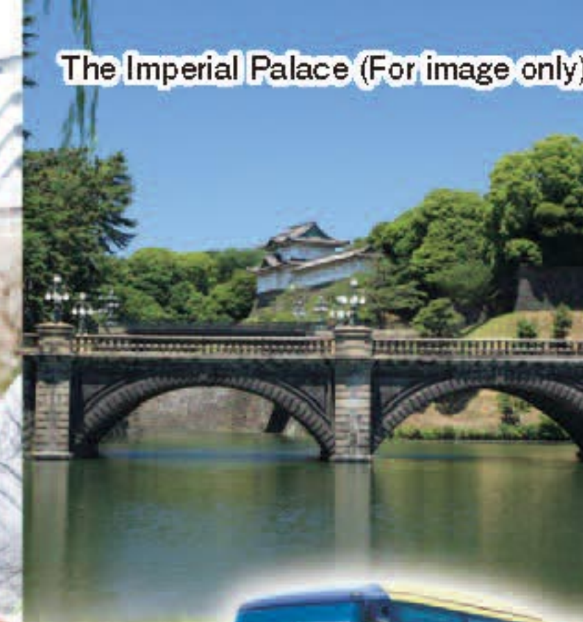
The Imperial Palace (For image only)