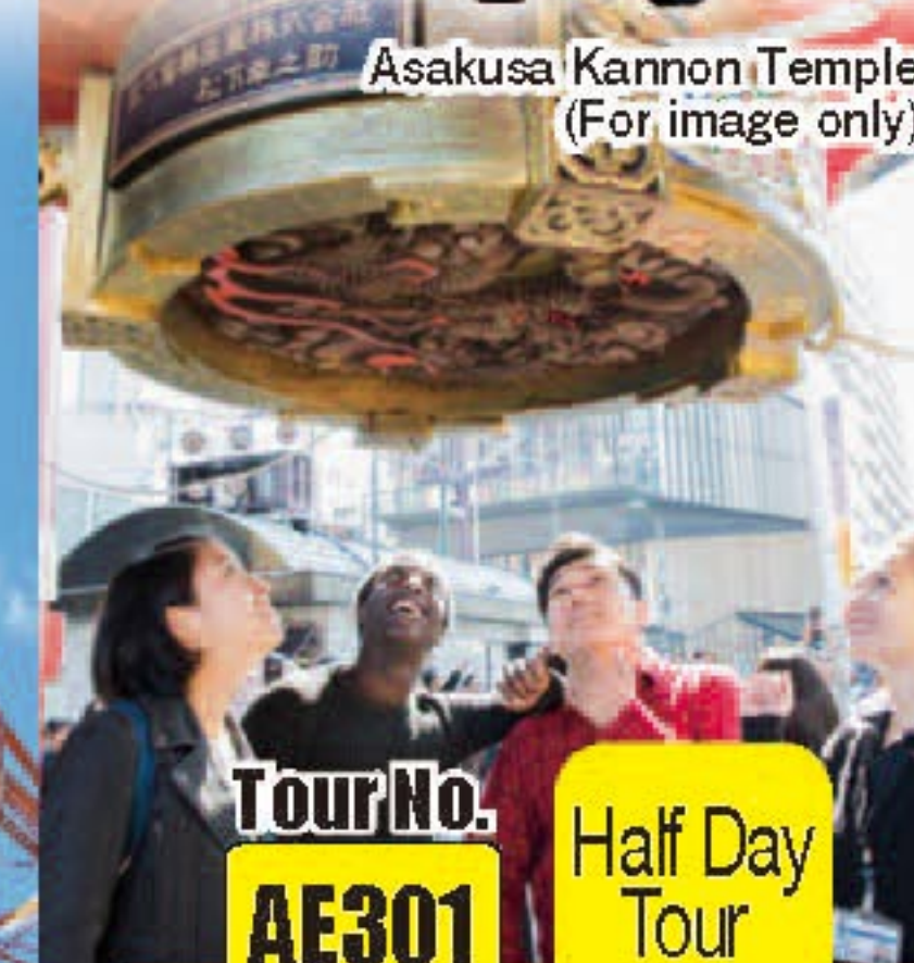
Asakusa Kannon Temple (For image only)