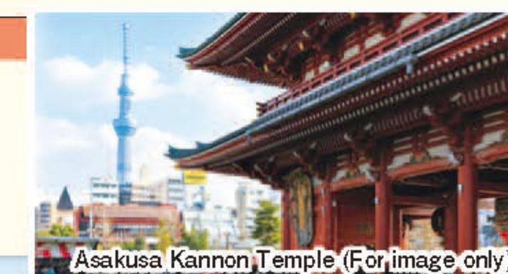
Asakusa Kannon Temple (For image only)

1. The tour at the Imperial Palace Area (Kokyo-mae) is nearby Nijubashi (approximately 10 minutes).