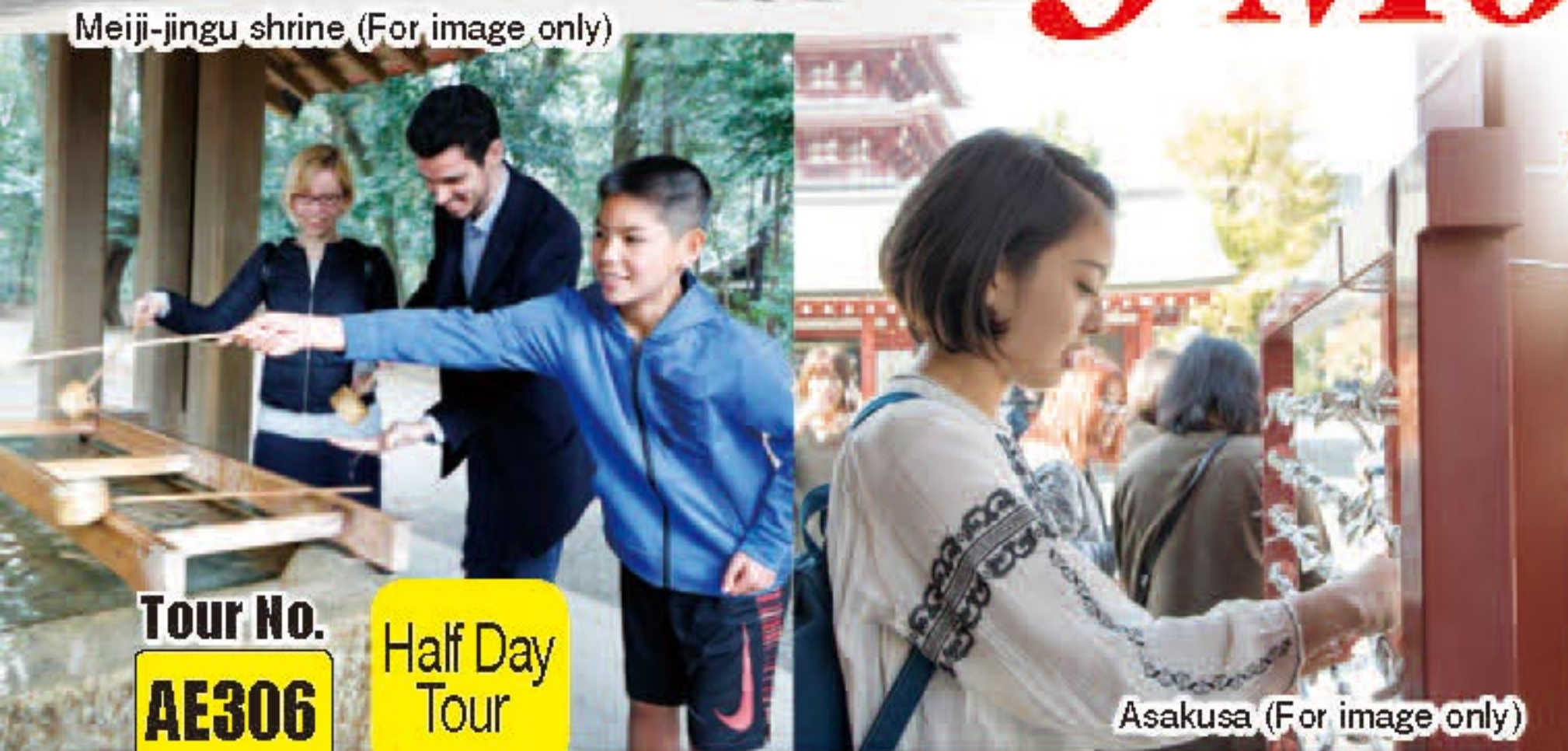
Asakusa (For image only)